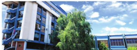
Faculty of Science and Mathematics, Nis, Serbia