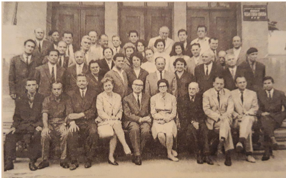
Figure 1. Teaching staff in front of High pedagogical school in 1962 (Kerković and Ćirić, 2002).

physics-chemistry and mathematics. In accordance with this division, an adequate allocation of teaching staff was carried out within these groups.